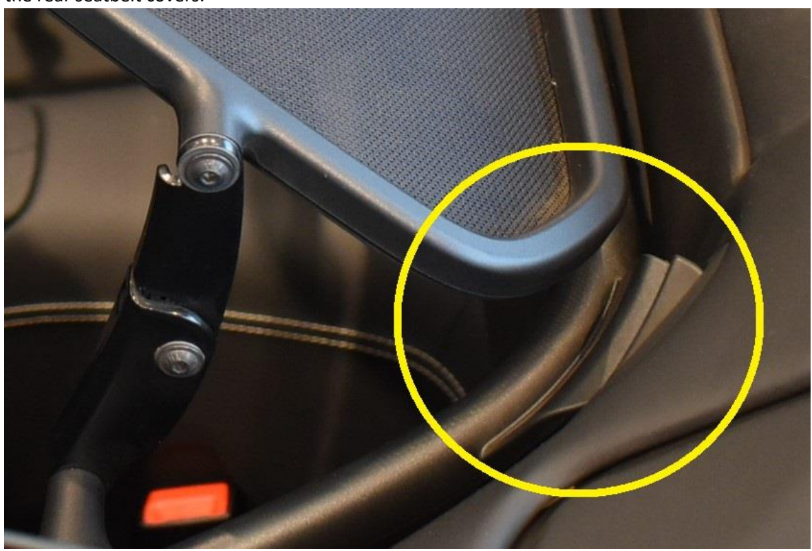
STEP 3 Unlock the side pins of the wind deflector and click the wind deflector in the factory fitted wind deflector mounts.

Place the wind deflector in the car and slide the rear pins of the wind deflector into the opening of the rear seatbelt covers.